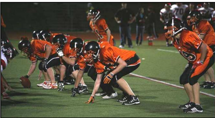
The JV O-line dominated in the playoff game