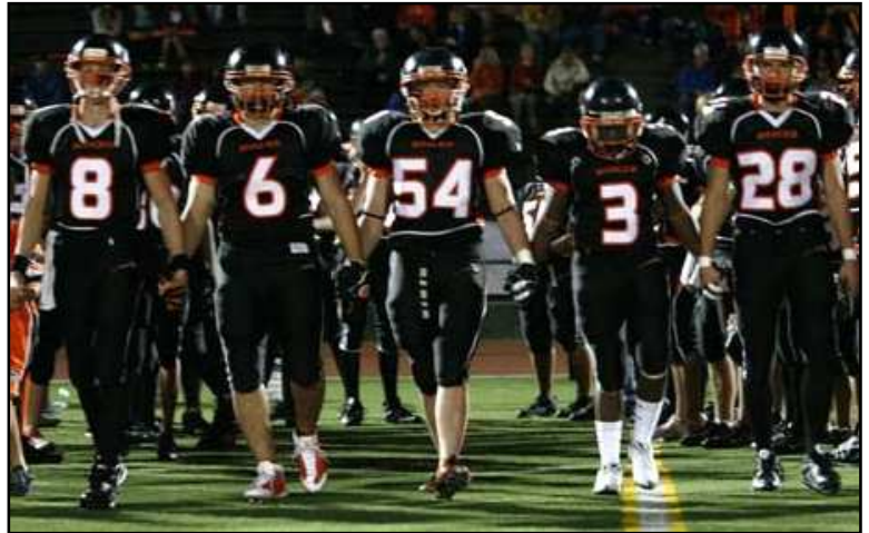
Hyacks coming together for the playoffs

If the Hyacks are to become provincial champions this season, the first step will be to knock off the defending provincial champs, Terry Fox, this Friday night at McLeod Stadium in Langley. The Ravens advanced to face the Hyacks thanks to a 48-14 win over Carson Graham in the wildcard round last week. New West enters the game following a bye week as a result of their 2 nd place finish in the Western conference.